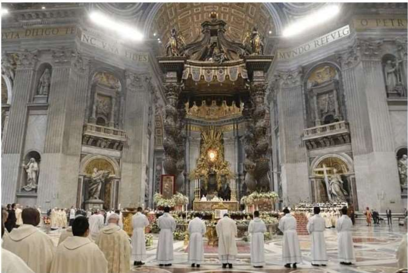
Bernini's baldacchino at the papal Mass on Jan. 1, 2024.

Pope Urban VIII commissioned Bernini in 1624 to design and build the enormous canopy over the Papal Altar of the Confession, located directly over the tomb of St. Peter the Apostle.